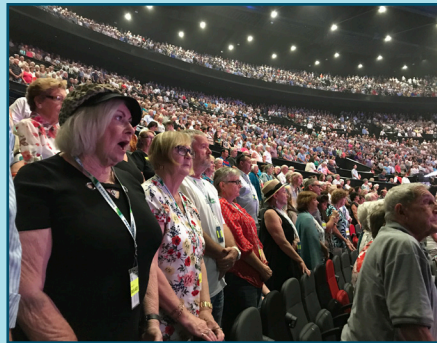
FACS Premier's Gala Concert