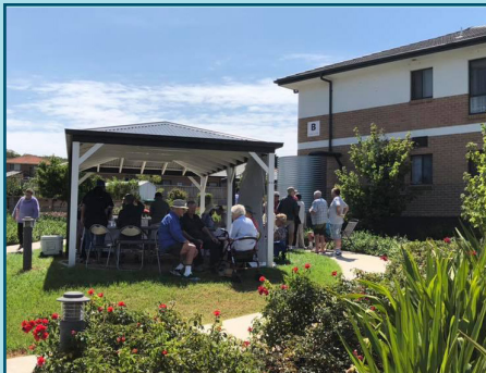
Central Gardens BBQ