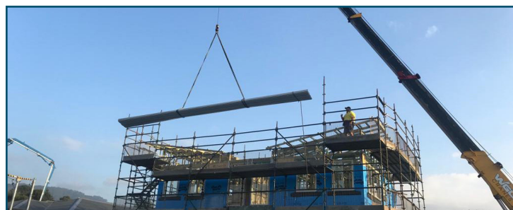
Eager Street, Corrimal