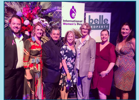
International Women's Day