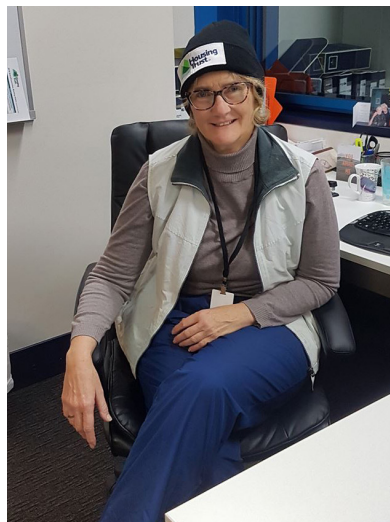
Getting ready for the CEO sleepout