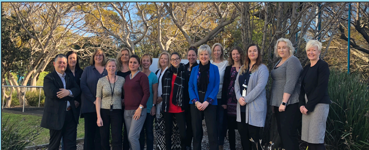
Housing Trust Customer Service & Support Team

Our Customer Service & Support Team are here to help you with all aspects of your tenancy.