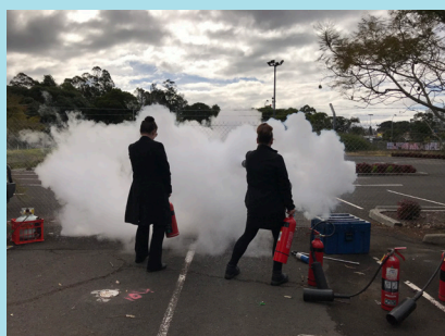
Fire safety training