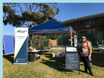
NAIDOC week kids craft at Greene Street, Warrarong