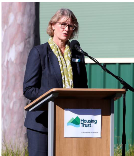
Farrell Gardens opening