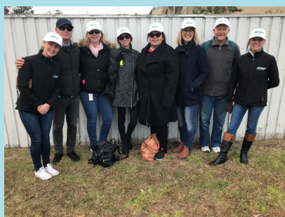
Reconciliation Day Walk