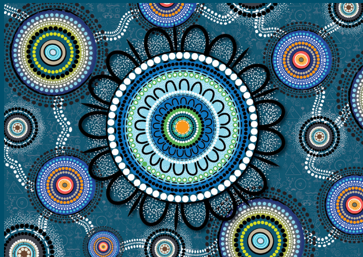
Artwork by JS Koori Design